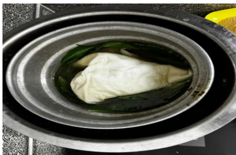
Fig:4 Double-boiling method