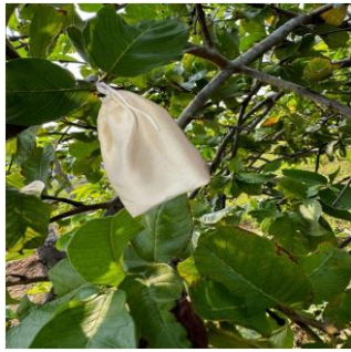
Fig-5: Final product