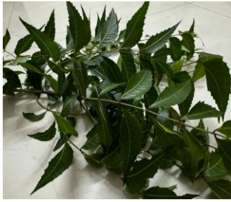
Fig no:1 Neem