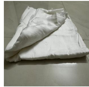
Fig:3 (Banana fabric)