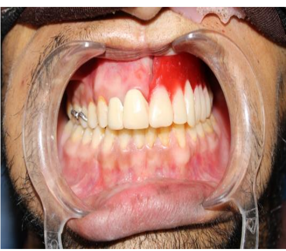
Fig 13:- Try in