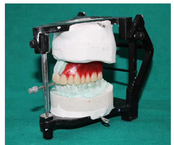
Fig 12:- Teeth arrangement on mean value articulator