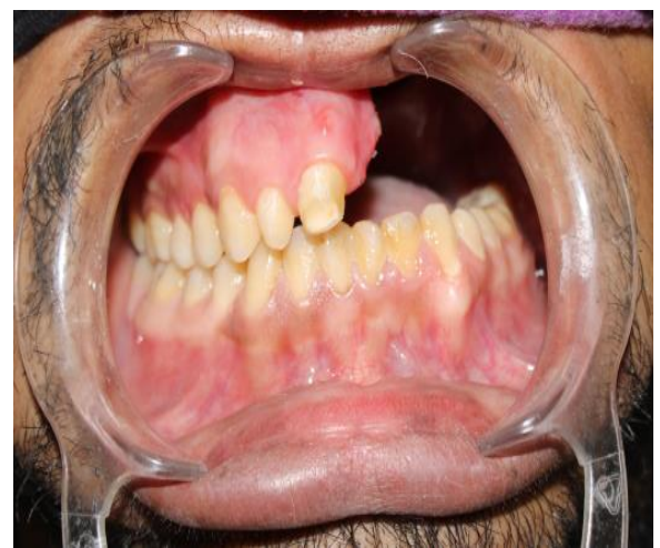
Fig 17:- Pre insertion photograph