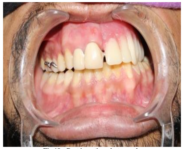
Fig 18:- Post insertion photograph