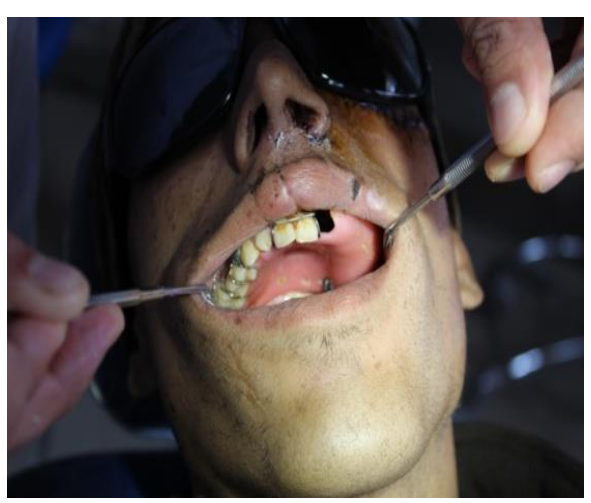
Fig 5:-Interim Obturator inserted

Tooth preparation was done in 11 and 12 to receive the metal ceramic crowns followed by rest seat preparation in relation to 15 and 16. The impression was made of rubber base impression material (Fig 6) and a cast poured. After proper diligence extra coronal castable attachments of Rhein 83