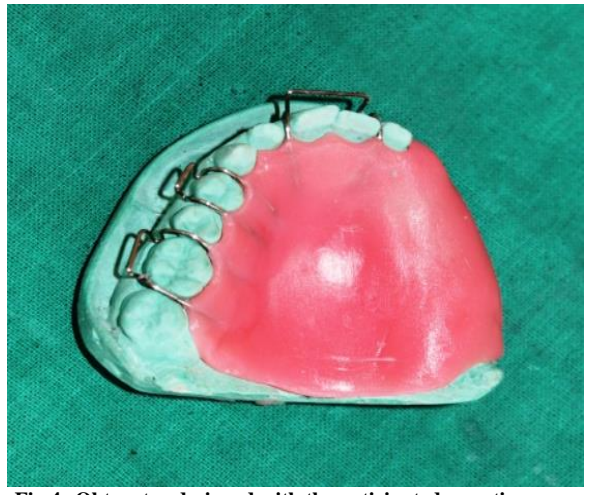
Fig 4:-Obturator designed with the anticipated resection area