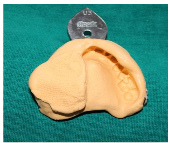
Fig 6:-primary impression

were selected Wax patterns fabricated for 21 and 22 with a connector and rest seat was prepared in relation to 15 and 16 to receive a embrasure clasp. Using a cast surveyor the male part of extra coronal castable vertical attachment was attached mesial to 11(Fig 9). Once casting procedure was completed, ceramic layering of the crowns was done and tried in the patient's mouth for fit and occlusion. The impression procedure for cast partial denture framework done. A cast partial denture framework pattern with a complete palate design was fabricated on the refractory cast (Fig10). The resilient vellow cap placed over the attachments before duplication and the female housing incorporated in the partial denture framework. The partial denture framework completed, and the framework trial done after luting the crowns with temporary cement. Occlusal rims were made the metal framework, and maxillomandibular relation was recorded (Fig 10). Wax try in was done (Fig 13), and final wax-up completed. The metal ceramic crowns with male attachments luted with type I GIC cement, and the rubber housing (yellow) fixed to the female portion of the obturator. The patient is now satisfied and comfortable with an obturator of lesser weight, better retention, and better esthetics (Fig 16&18).