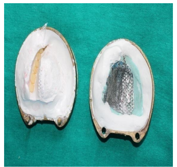
Fig 15:- Mould after de waxing