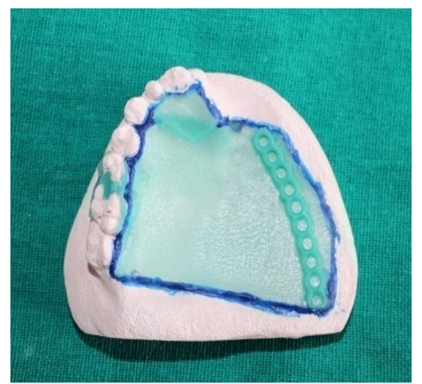
Fig 9:- Placement of attachments using surveyor