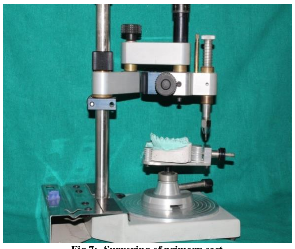
Fig 7:- Surveying of primary cast