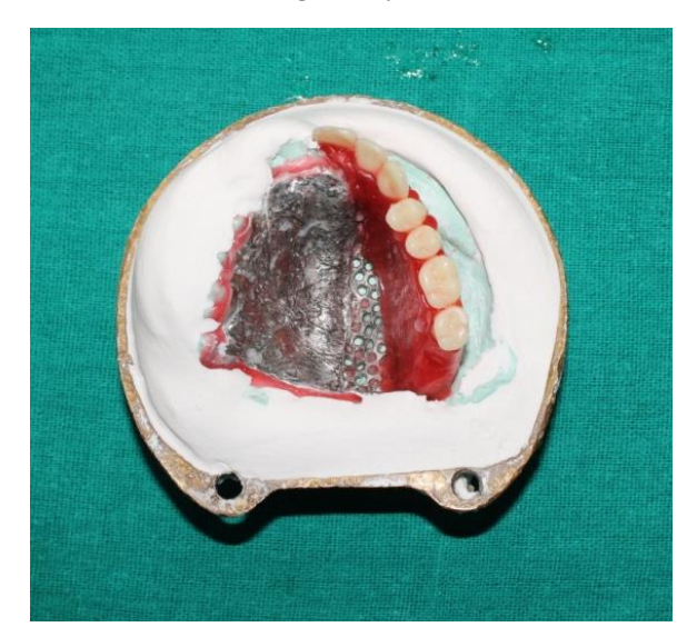
Fig 14:- Flasking of cast partial obturator