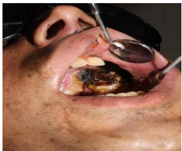
Fig 2:- Post-op intra-oral view