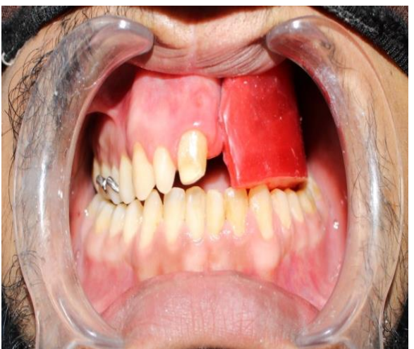
Fig 11:- Recording Maxillo mandibular relation