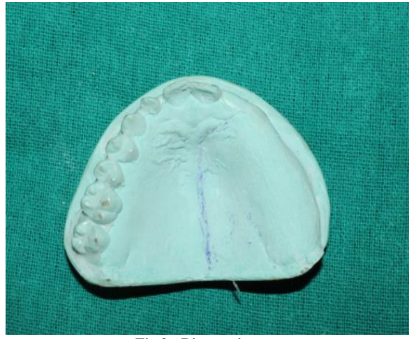
Fig 3:- Diagnostic cast