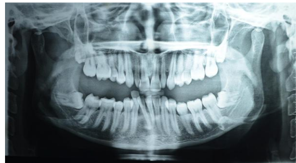
Figure 2: Physiologic mesial drift of third molars seen radiographically

SayselYigit Mustafa et al 14 in 2005 conducted a study to determine the relationship between the inclinations of second and third molars during a 2 to 2.5-year period in patients treated orthodontically both with and without premolar extraction and revealed that mandibular third molars showed an improvement in angulation relative to the occlusal plane in the first premolar extraction group.