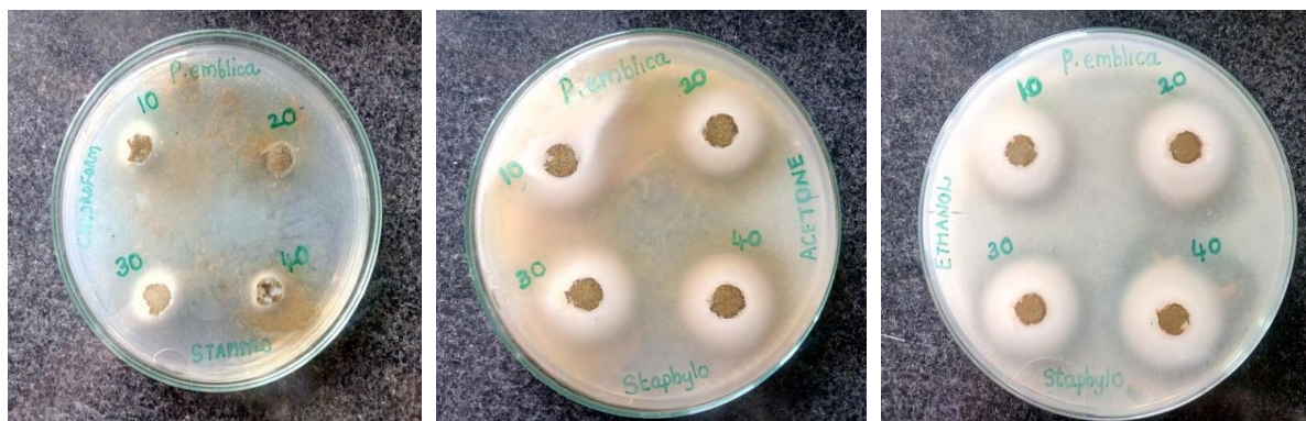
Fig 2: Plate showing antibacterial activity of P. emblica leaf extracts against S. aureus

Followed by the activity of ethanol was that of acetone extract which provided a zone of inhibition of 25.8 \pm 1.0 mm at a concentration of 40 \mu\text{l} . And its positive control showed an inhibition zone of 35.4 \pm 2.1 mm. Minimum antibacterial efficacy among the three extracts was for chloroform extract, providing an inhibitory zone of 11.8 \pm 0.3 mm at a concentration of 40 \mu\text{l} and it showed an inhibition zone of 35.4 \pm 2.1 mm in the positive control of Amoxicillin. According the research of Aqil et al; [41] Naim et al; [42] Oskay et al [43] it was interesting to note that the methanol and ethanol extracts from tulsi , oregano, rosemary, lemongrass, Aloe vera and thyme displayed antimicrobial activity to S. aureus . Previous studies also revealed the antibacterial potency of the investigated plant extracts and essential oils against S. aureus .