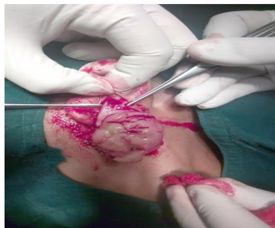
Figure 3: Showing intraoperative picture of the well encapsulated lesion