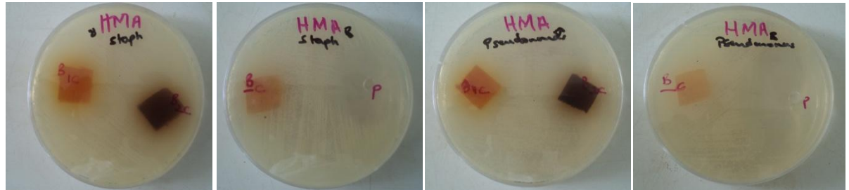
Figure 1. Growth of staphylococcus aureus and Pseudomonas aeruginosa on cotton fabrics in petri dishes

Cotton fabrics: Fig. 1 below shows the activity of cotton fabric samples against the selected types of bacteria. From left to right in the photograph, B_{1c} and B_{2c} are fabric impregnated with aid of alum and ferrous sulphate as mordants, \underline{B}_{C} impregnated without mordant and P is not an impregnated fabric. As can be noted, the impregnated fabrics with the use of mordants registered interruption of microbial growth beneath and clear zones of inhibition towards the fabrics and those impregnated without the use of mordant registered interruption of growth beneath the fabric with no clear zone of inhibition towards them.