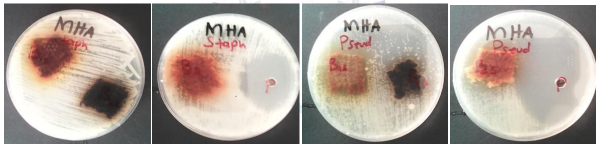
Figure 2. Growth staphylococcus aureus and Pseudomonas aeruginosa on cotton fabrics in petri dishes

Silk fabrics: The bioactivity of impregnated silk fabrics is shown in Fig. 2 below. All the mordanted impregnated fabrics and unmordanted registered interruption of microbial growth beneath the fabrics and clear zones of inhibition towards them. The non impregnated fabrics registered no activity on both type of the bacteria. The summary of the results is tabulated in Table 2 below. As can be noted from results in Table 3, the bacterial growth rates towards allthe impregnated silk fabrics were very weak. This is aimed at determining the ability of an antimicrobial agent impregnated in the fabric to diffuse through agar gel. <sup>[10]</sup>